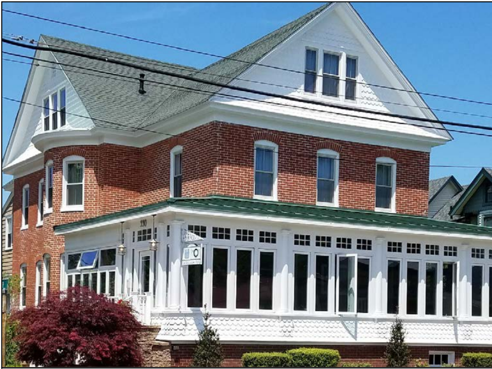
Savannah Inn 330 Savannah Road Lewes, DE 19958